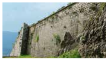
The counterscarp, in the ditch.

30 mn hike, loop walk, 30m descent. To visit the ditch and glacis, exit the keep via the former drawbridge and walk along the ramparts.