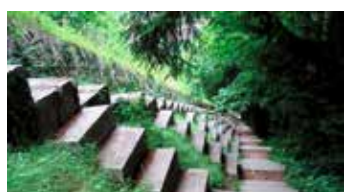
The Grand Staircase: 380 steps!

The geology trail (in french only) with its totems helps you discover the history of mountains, rocks and environment. It was set in place by University Joseph Fourier, SIPAVAG and the Grenoble city council. Walk alongside the wall to get to the Grand Staircase. Your way down the stairs will lead you into the heart of Saint Laurent district, close to the archaeological site and CCSTI.